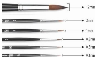
ROUND BRUSHES SABLE HAIR OR SIMILAR