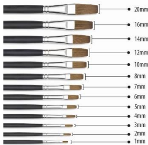
FLAT BRUSHES SABLE HAIR OR SIMILAR